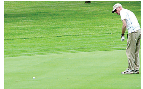
Come on, now, go in the hole!