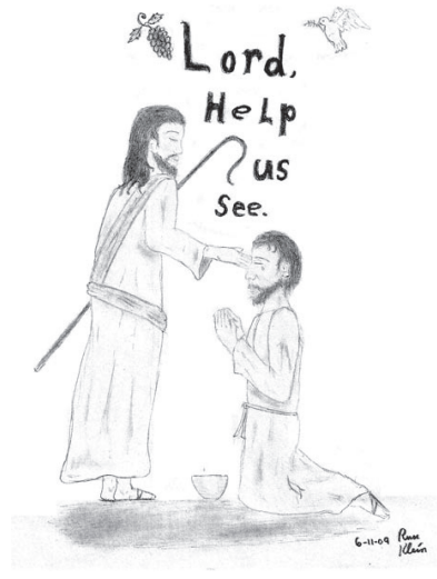
Drawings by Russ Klein, FDCF 6-09