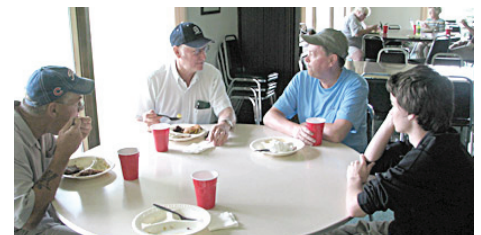
A meal and conversation capped off a fun golf tourney fund raiser.