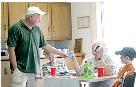
Everyone who played got a prize.