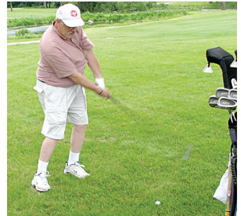
Pastor Stone called it a practice swing.

A total of $1,140 was received, and after expenses, netted us $791 for Thrivent matching funds.