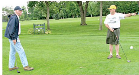
The green is WAY over there!